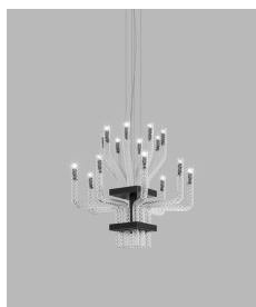
STRDU SP DOP