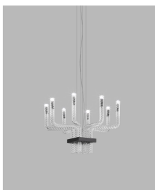
STRDU SP Q