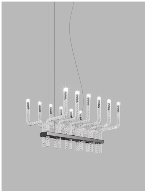
STRDU SP R CRRI NN G9 CE